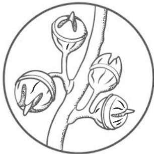
Seeds formed inside fruit