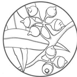
Flower buds with caps