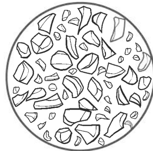
Seeds are released